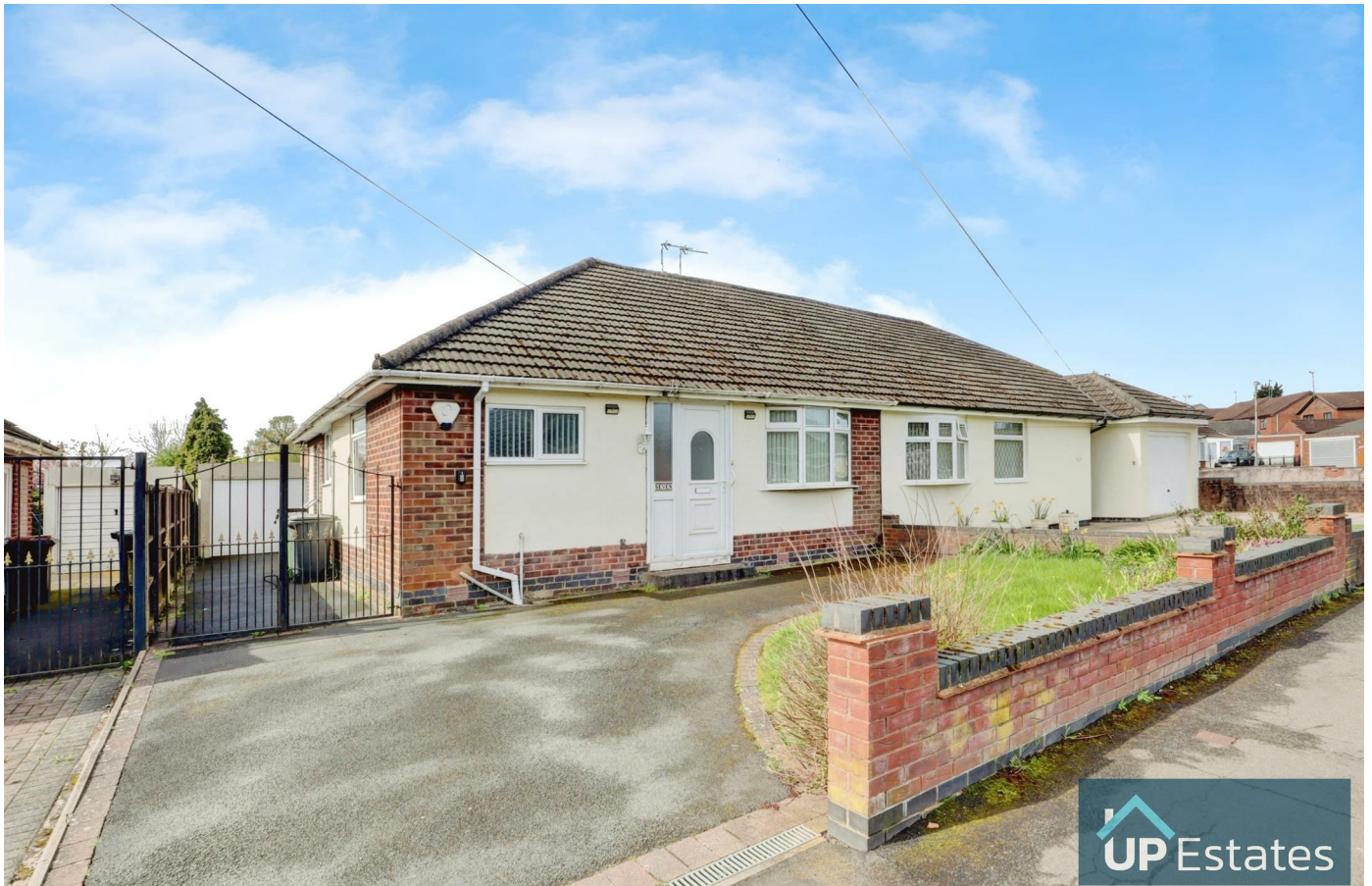
Hayes Green Road, Bedworth